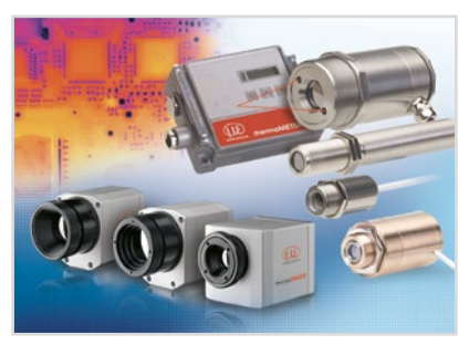
Sensors and measurement devices for non-contact temperature measurement