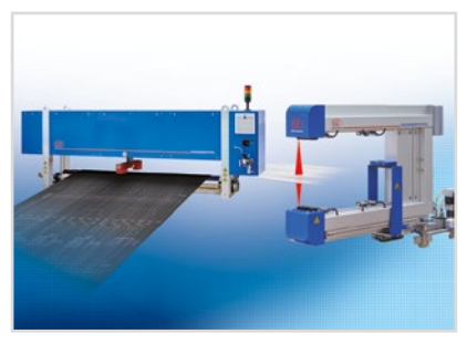
Measuring and inspection systems for metal strips, plastics and rubber