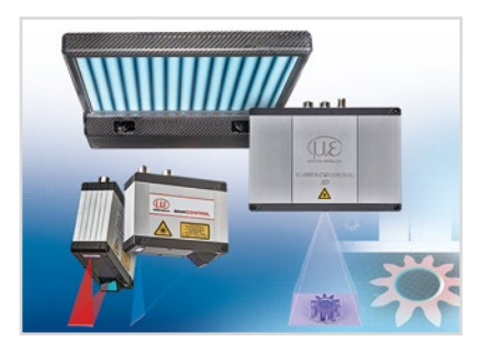
3D measurement technology for dimensional testing and surface inspection