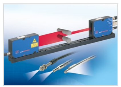
Optical micrometers and fiber optics, measuring and test amplifiers