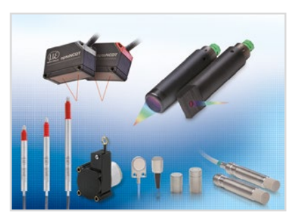
Sensors and systems for displacement, distance and position